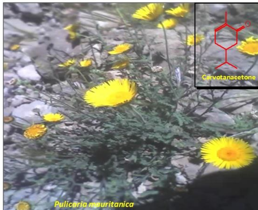
Fig. 1. P. mauritanica in its native habitat to Amellagou (Southeast of Morocco).

was used for extraction of the plant volatiles. Optimization of conditions was carried out using fresh aerial parts of the plant (1.2 g in a 20 ml vial) and based on the sum of total peak areas measured on GC-FID. The temperature and the equilibration time were selected, respectively, after three different experiments at 50, 70 and 90 °C, and after three different experiments at 60, 90 and 120 min. The extraction time was selected after three different experiments at 15, 30 and 60 min. After sampling, SPME fiber was inserted into the GC and GC-MS injection ports for desorption of volatile components (5 min), both using the splitless injection mode. Before sampling, each fiber was reconditioned for 5 min in the GC injection port at 260 °C. HS-SPME and subsequent analyses were performed in triplicate. The coefficient of variation ( 9.6\% < CV < 13.4\% ) calculated based on the total area obtained from the FID-signal for the samples indicated that the HS-SPME method produced reliable results. In the same way, the CV of the major compounds was always less than 15%.